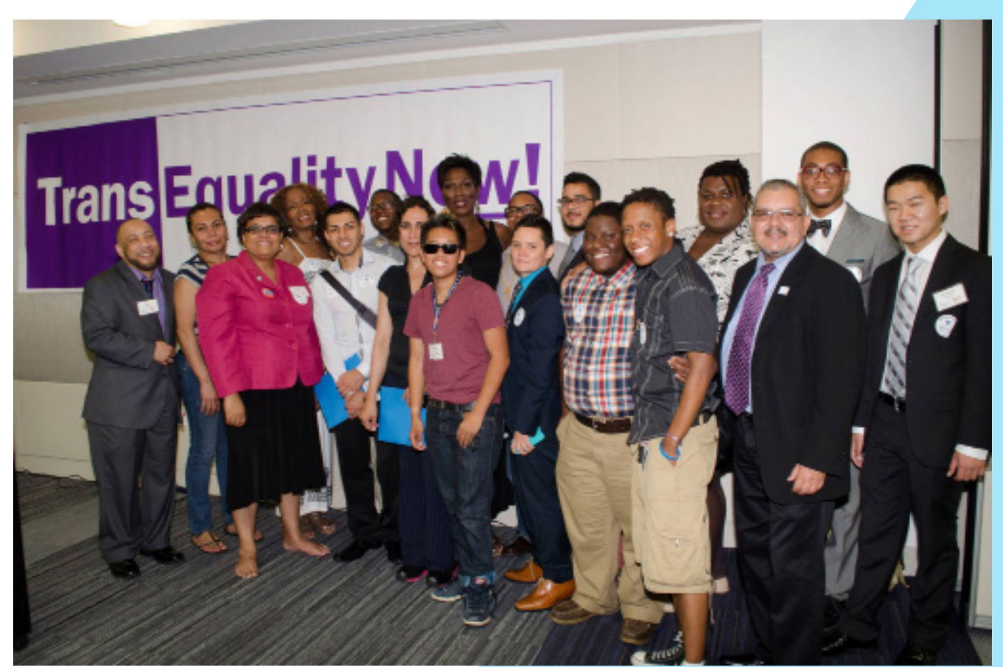
Members of the Trans People of Color Coalition at the 2013 Lobby Day