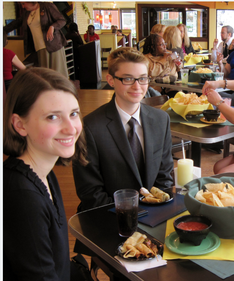
NCTE Members having lunch after the 2011 Annual Lobby Day.